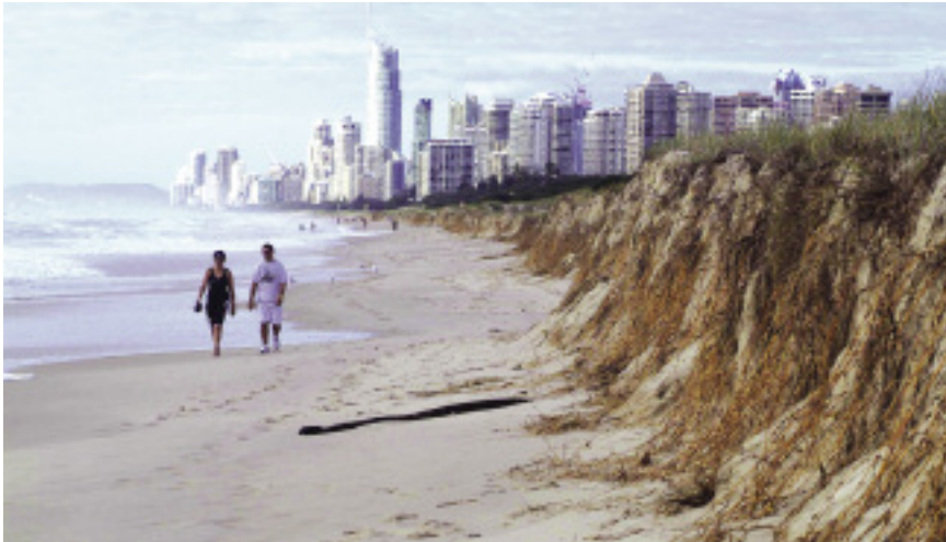
Coastal erosion results in the landward movement of the coastline, typically at rates of tens to hundreds of times the rate of sea level rise.

and changes in atmospheric and oceanic conditions.